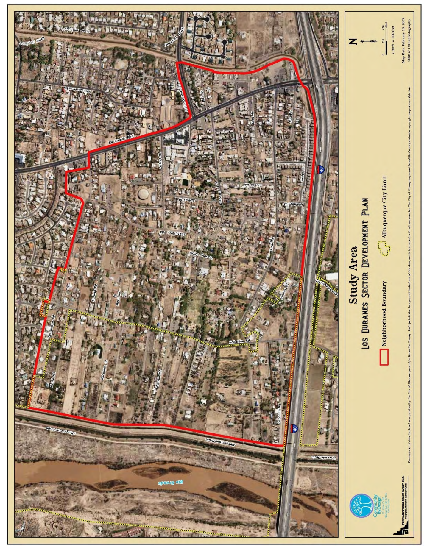
Figure -1 Study Area Map